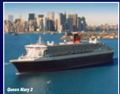
Queen Mary 2

The Queen Mary 2 is the ultimate way to cross the Atlantic in leisurely style. All our passengers will travel in Princess or Queens Grill suites with private balcony. Your journey will be six nights westbound or seven nights eastbound. Queen Mary 2 is fully stabilised and offers a vast array of luxuries on board. The most advanced superliner ever designed to cross the Atlantic will be the perfect partner to your private jet flight, but at a delightfully leisurely pace.