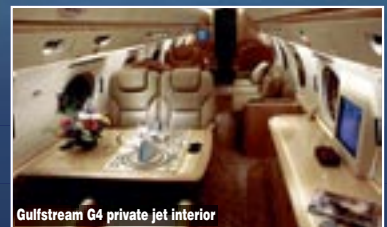
Gulfstream G4 private jet interior

A Gulfstream G4 intercontinental private jet flying direct from the Signature Aviation private jet terminal at London Luton Airport. Ten passengers will occupy tables of two or four seats. Your aircraft will arrive and depart from New York Teterboro Airport private jet terminal. No check in. No queuing.